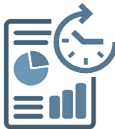
Real-time status and reports