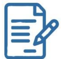
Sign-off and closure