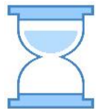
Notifications and escalations